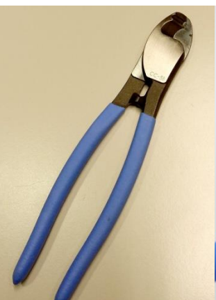
CC-38 (200mm) size Cable Cutter