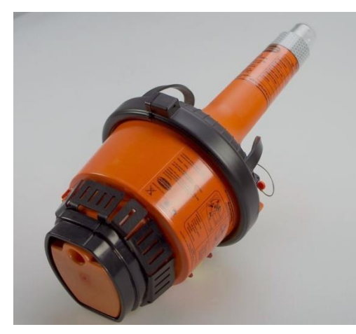
Tron 40VDR with storage module ready for removal