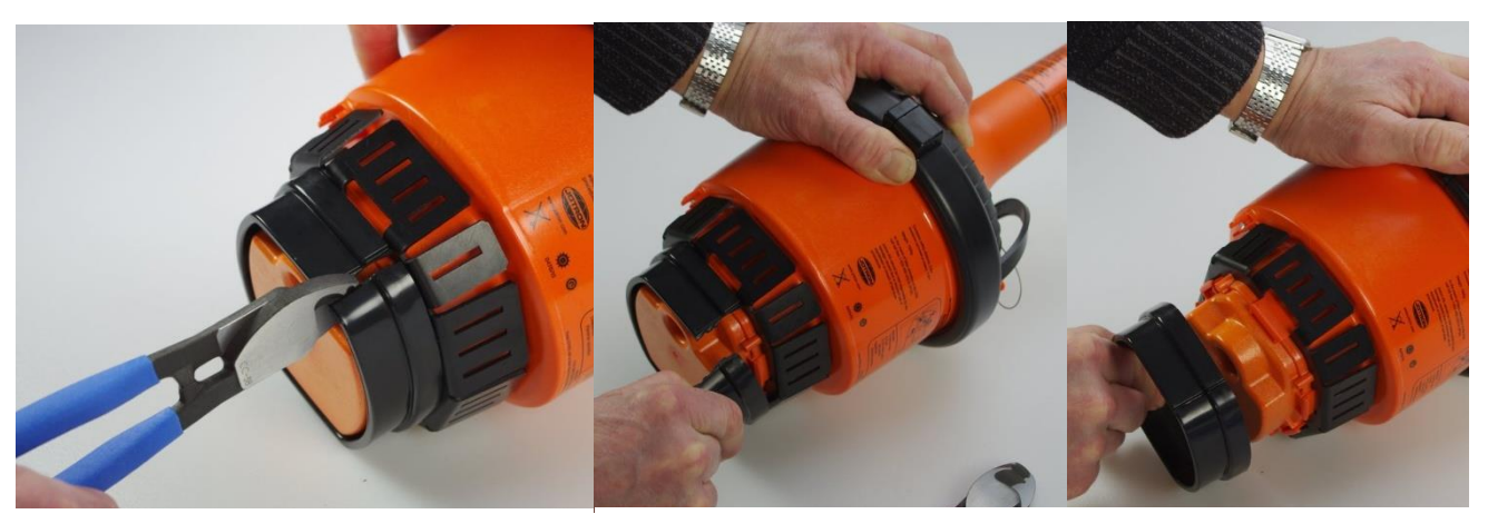
Use some force to cut through the "Bumper"