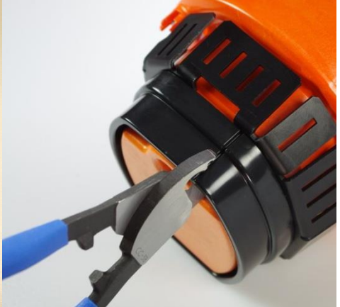
Place the Cable Cutter as seen on picture